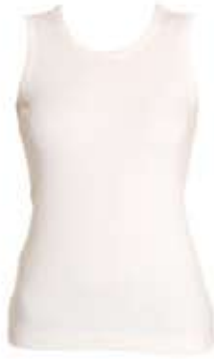
TANK TOP: 21 COMFORT RAW WHITE