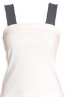
TOP: 21 SEA GREY