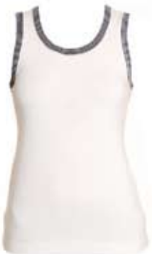
TANK TOP: 23 DEW BLACK