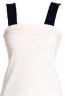
TOP: 21 SEA BLACK