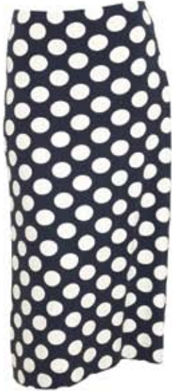
Skirt: 03 QUIET C: NAVY DOT ALSO AVAILABLE IN GOLDEN CHECKS NAVY BLACK