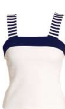
TOP: 19 BREEZE BLUE