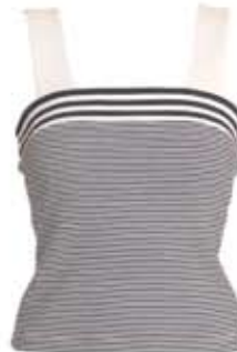
TOP: 20 SPRING GREY