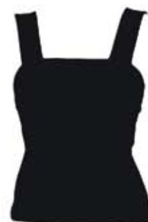
TOP: 22 OCEAN BLACK