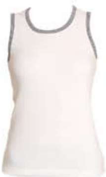
TANK TOP: 23 DEW GREY