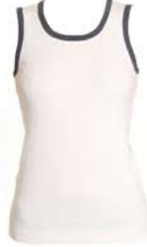
TANK TOP: 25 ISLE GREY