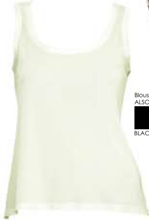
Blouse: 10 SENSE C: MINT ALSO AVAILABLE IN BLACK