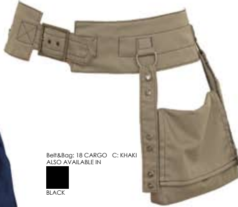
Belt&Bag: 18 CARGO C: KHAKI ALSO AVAILABLE IN BLACK