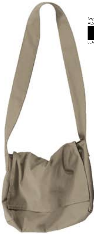
Bag: 19 BAG C: KHAKI ALSO AVAILABLE IN BLACK