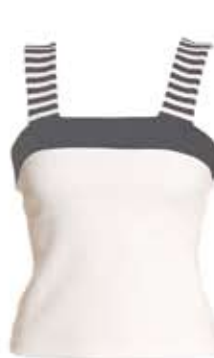
TOP: 19 BREEZE GREY