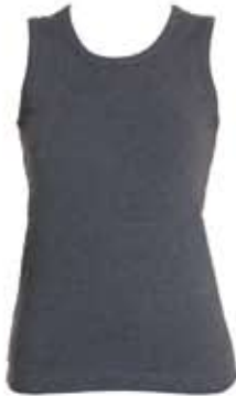
TANK TOP: 21 COMFORT GREY