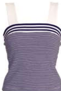
TOP: 20 SPRING BLUE