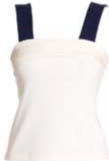
TOP: 21 SEA BLUE