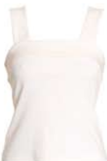
TOP: 22 OCEAN RAW WHITE