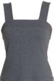
TOP: 22 OCEAN GREY