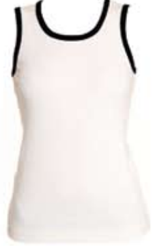
TANK TOP: 25 ISLE BLACK