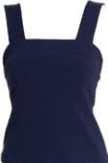
TOP: 22 OCEAN BLUE