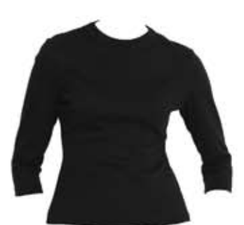
BLOUSE: 20 PURE BLACK, GREY, NAVY OR RAW WHITE