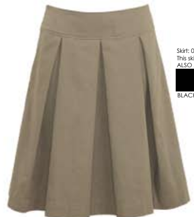
Skirt: 04 CHOICE C: KHAKI This skirt is turnable ALSO AVAILABLE IN BLACK