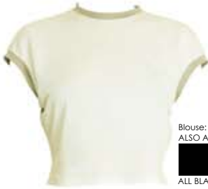
Blouse: 12 SILK C: MINT w. dust ALSO AVAILABLE IN ALL BLACK