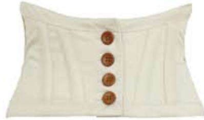
Corset: 22 MINIATURE C: creme w. brown leather buttons KHAKI BLACK These two colours w. dark horn buttons