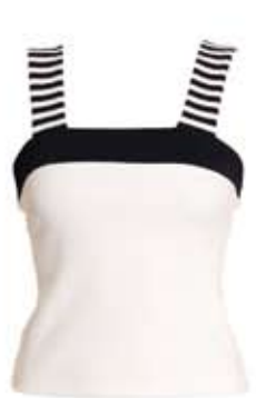
TOP: 19 BREEZE BLACK