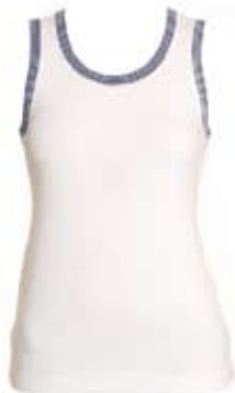
TANK TOP: 23 DEW BLUE