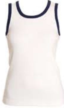
TANK TOP: 25 ISLE BLUE