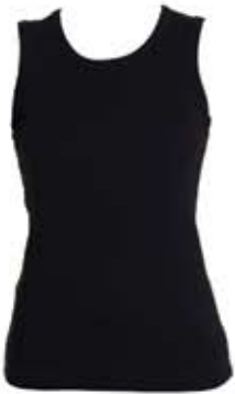
TANK TOP: 21 COMFORT BLACK