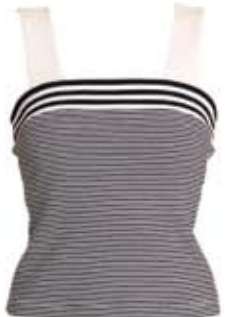
TOP: 20 SPRING BLACK